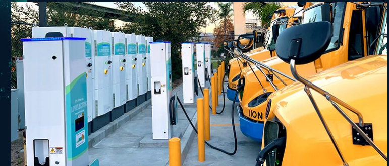
Future-Proof Solutions V2G and Sequential Charging