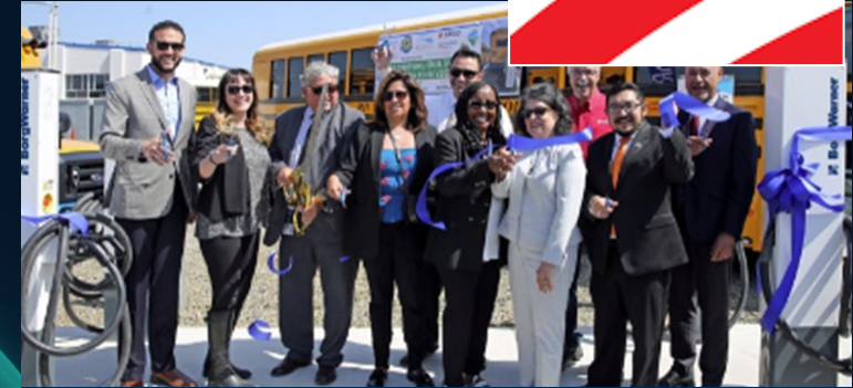
Twin Rivers Bus Depot Ribbon Cutting - CA